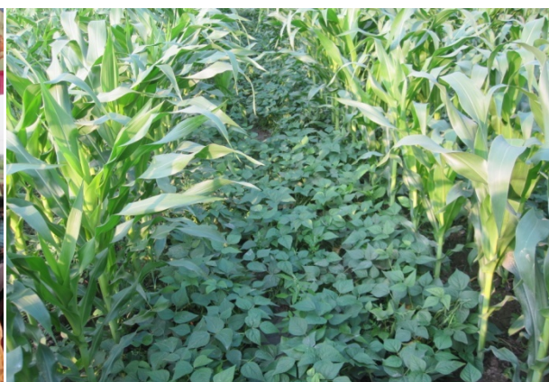
Maize and Potato is cultivating in same land