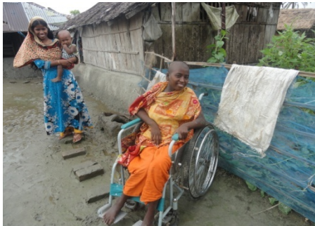
Disable woman stting on a wheel chair provided by USS

The main activities of the project was the disaster risk reduction through small scale mitigation, disaster preparedness and management.