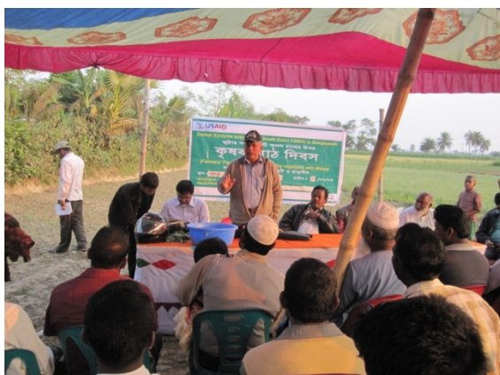
Field day observation with the participation of farmers