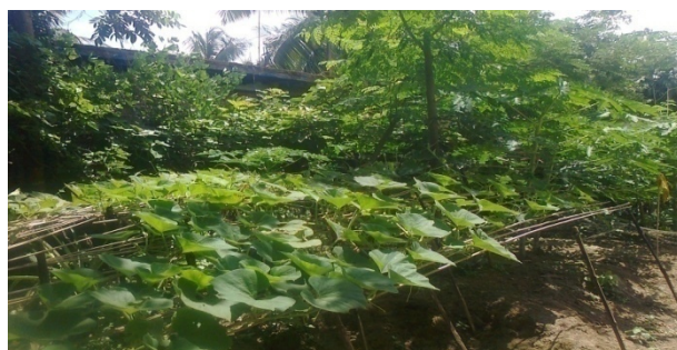
Vegetable field under CIMMYT project