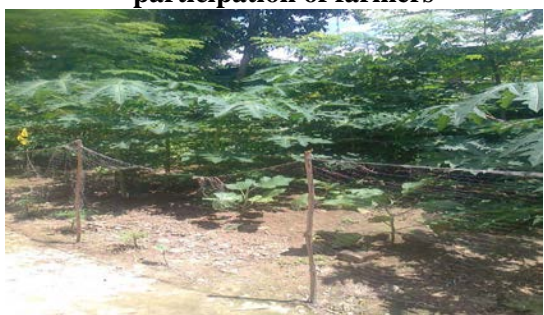
High quality papaya plant