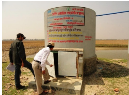
Rain Water harvester for safe water supply