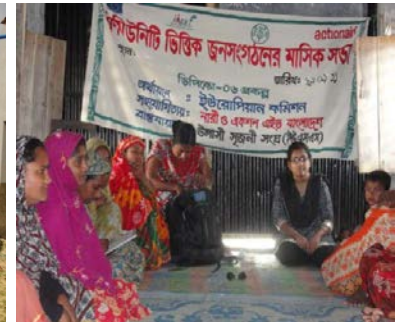
Monthly meeting of women savings group

Of late this project have ended but newly incepted as DIPECHO VII. During the reporting period this project have been completed so many extraordinary activities that are shown in bellow: