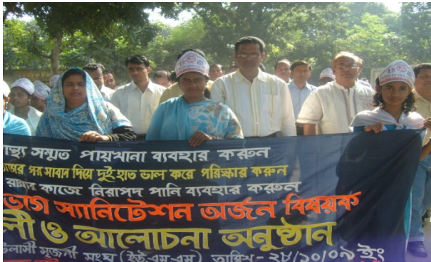
Rally on achieving 100% sanitation with Kalia upazila chairman & ED USS