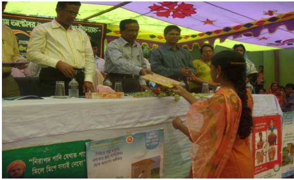
DC of Narail giving award to CHP for achieving 100% sanitation