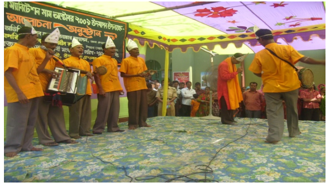
Performing Jari song on sanitation by SHEWA-B cultural team